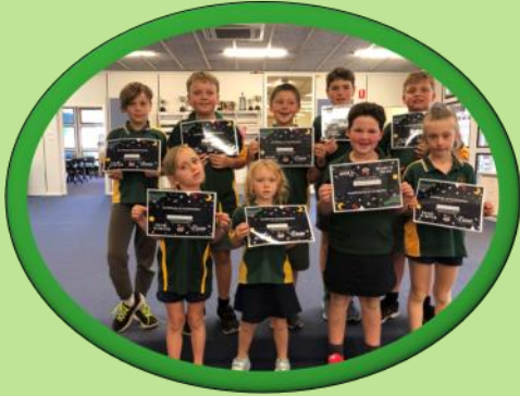
Participation awards for DEADLY SCIENCE