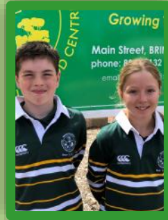
LOOK at Our NEW uniform

Swimming lessons completed successfully 2021